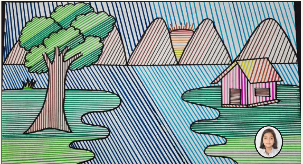
Srishti Bharti, VII B (Peace House)