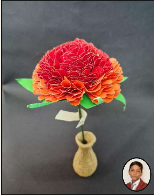
Kavyansh, VII C (Freedom House)