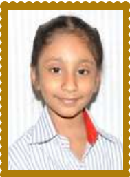
Divisha I B