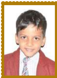
Darsh I C