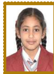
Sukhreet II B