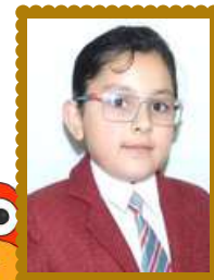
Kaira II B