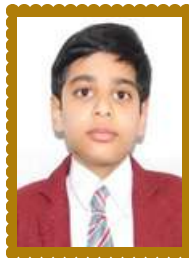
Shaurya II A