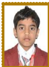
Aayan II B