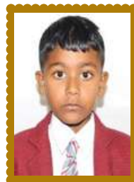
Ritik II B