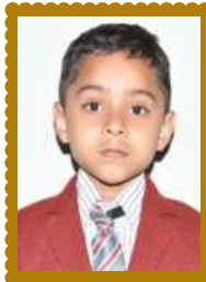
Manthan I B