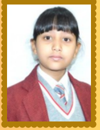
Aavya II A