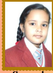
Sanavi II A