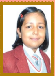
Diya II A