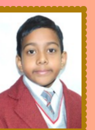
Parikshit II B