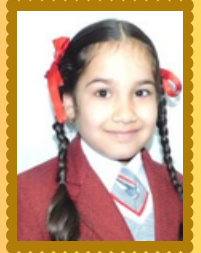
Akshita II B