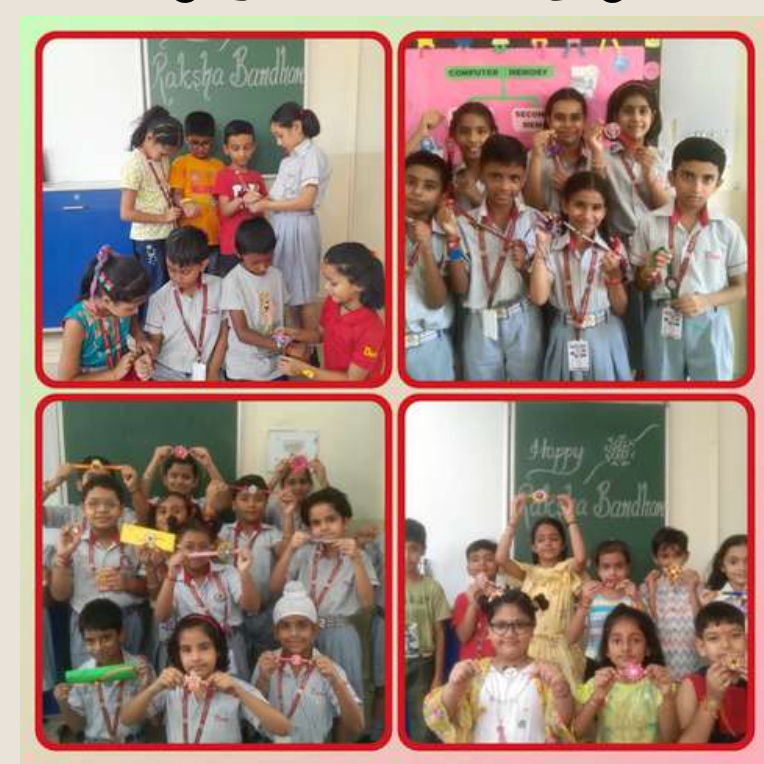
RAKSHA BANDHAN CRAFT ACTIVITY