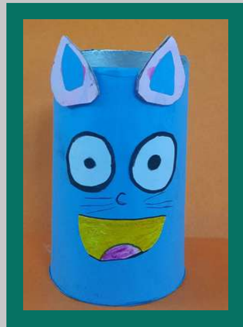
PANCHAM CLASS IV A