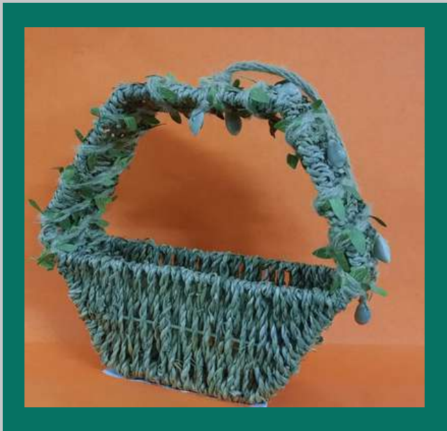
LAVANYA AGGARWAL, CLASS VII B