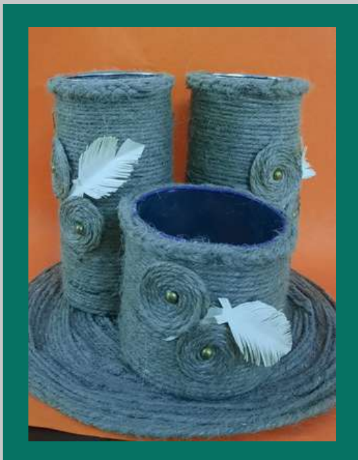
AANVI CLASS X A