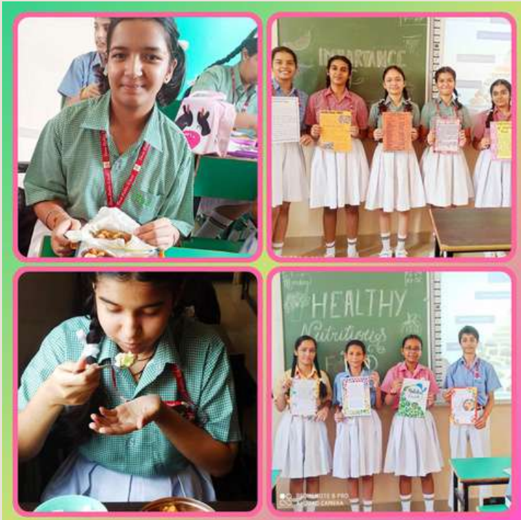
HEALTH & NUTRITION ACTIVITY