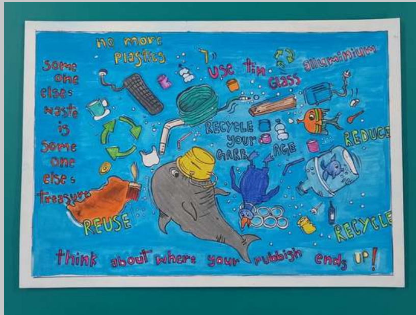
ARSHEET KAUR, CLASS X A