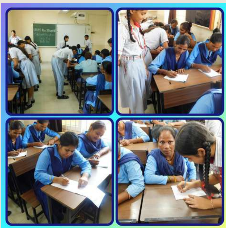
ULAS NAVBHARAT SAKSHARTA KARYAKRAM