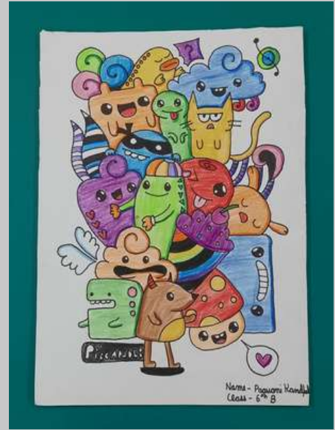
PAAVANI KANDPAL, CLASS VI B