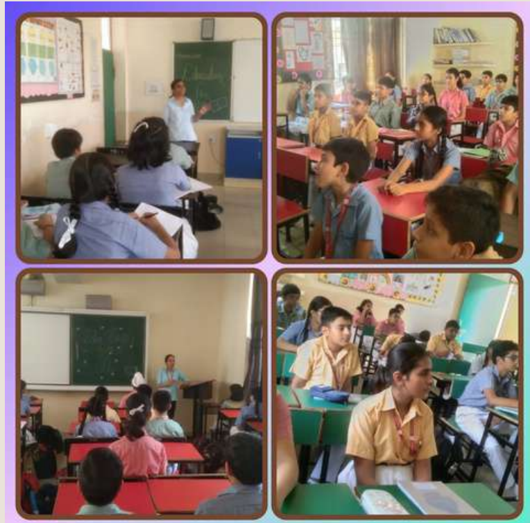
DISCUSSION ON EDUCATION FOR ALL