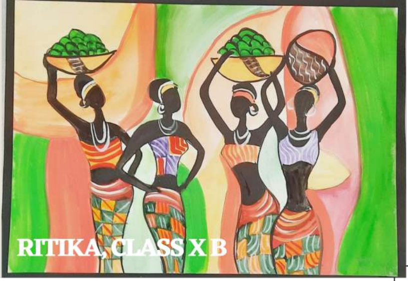
RITIKA, CLASS X B