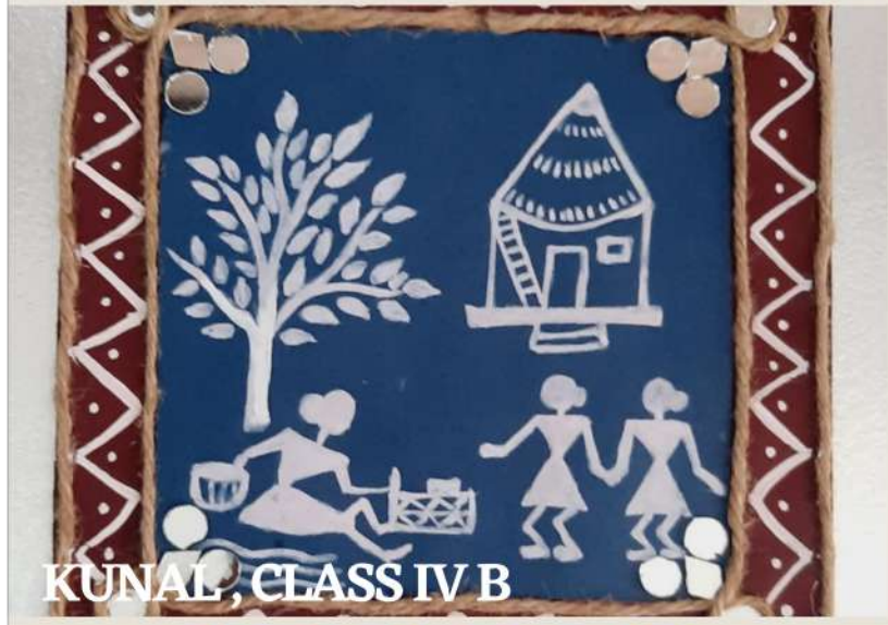
KUNAL, CLASS IV B