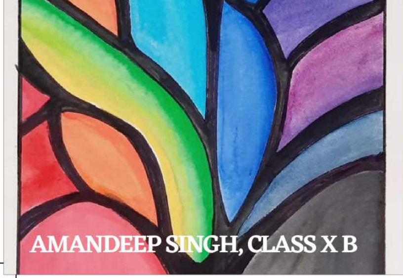
AMANDEEP SINGH, CLASS X B