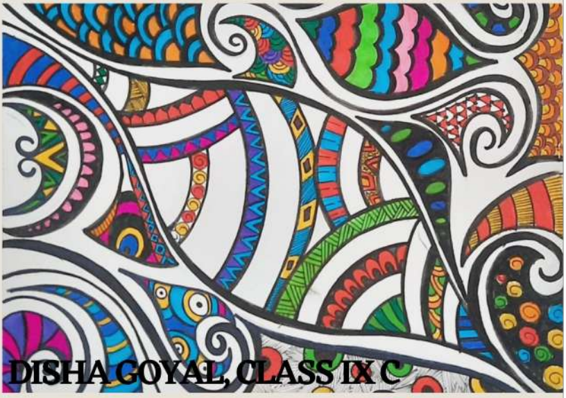
DISHA GOYAL, CLASS IX C