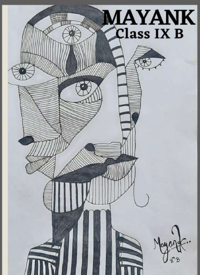
MAYANK Class IX B